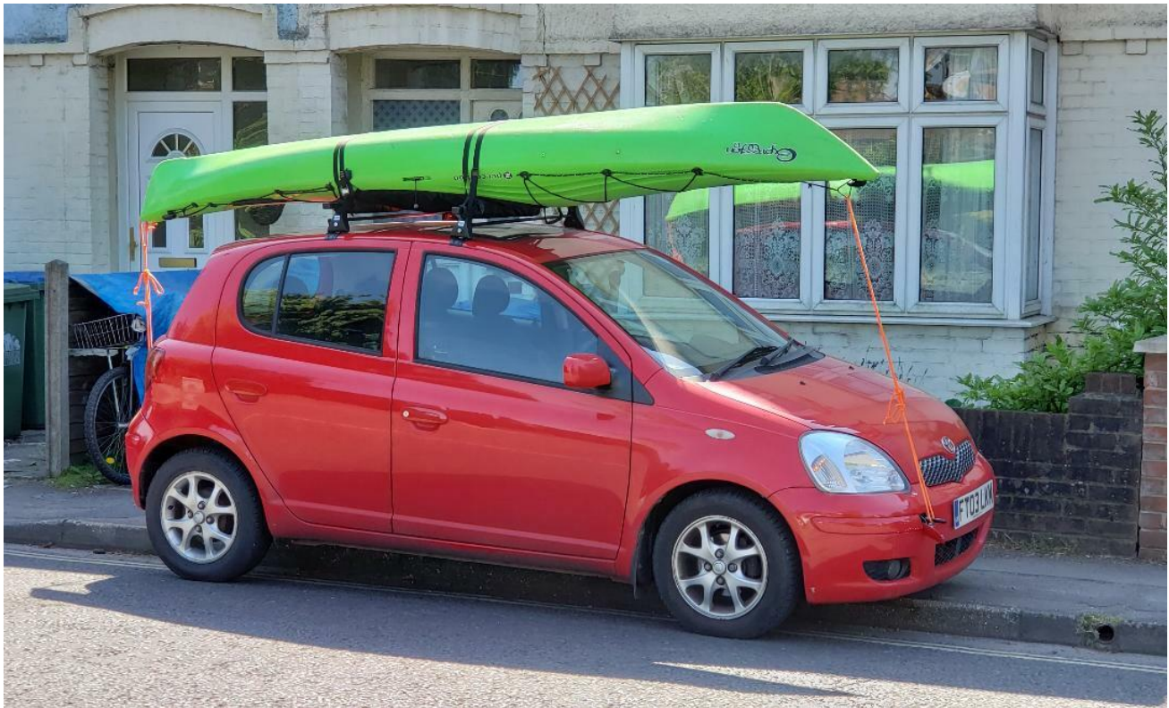
She rather dwarfs my little Toyota Yaris!