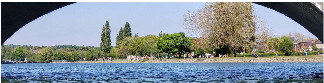
There are lots of people in the riverside park. It's MUCH safer on the river!